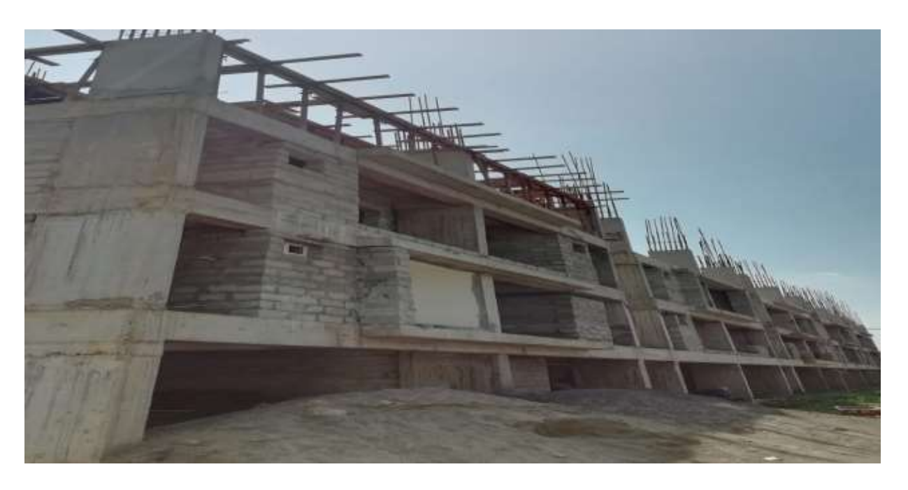
Block A2: Second Floor Level slab concrete casting 100% completed. Column concrete upto Third floor level 50% completed and balance work on progress.

Block A1: Columns upto Fourth floor level 100% completed. Slab Shuttering works in Fourth Floor level 40% completed and balance work on progress.