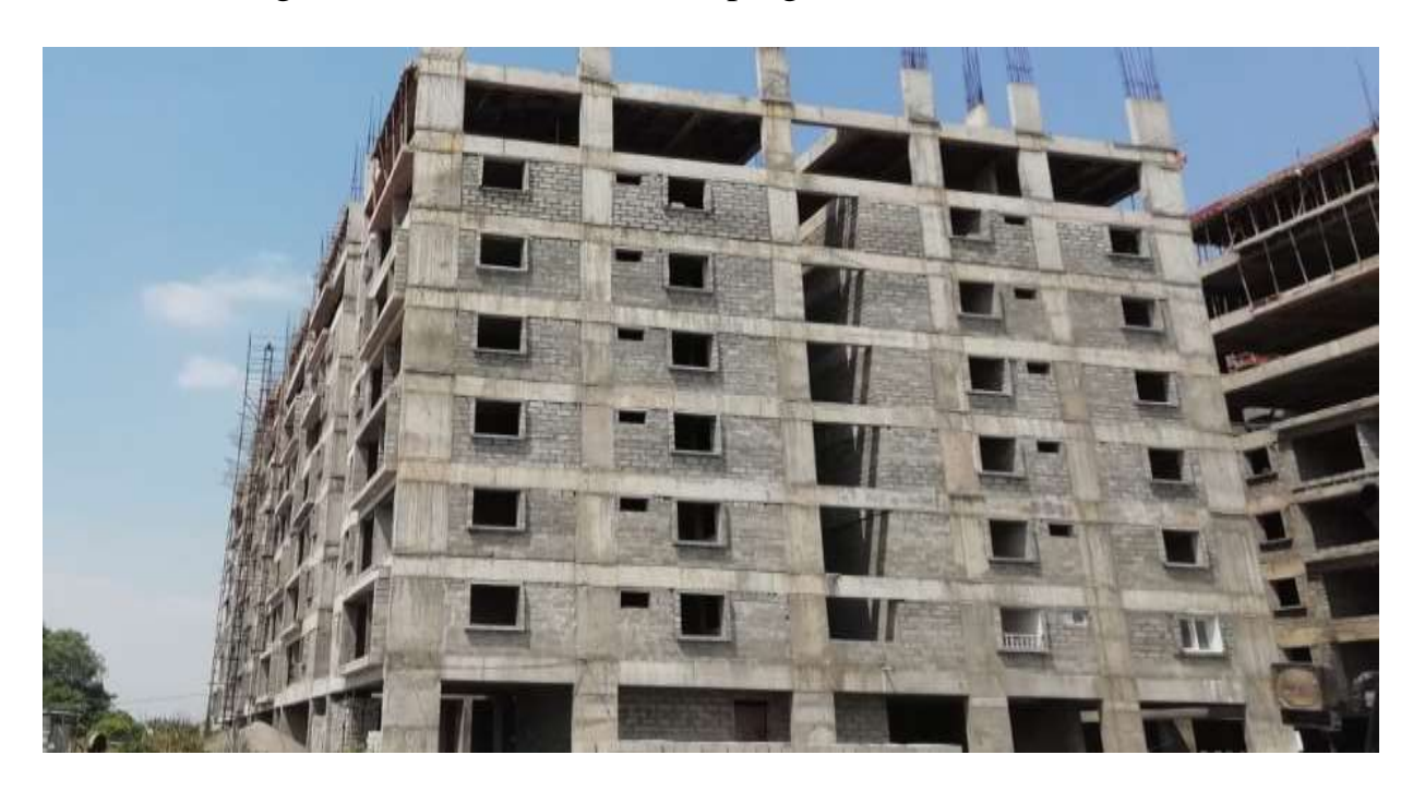
Block C2: Columns upto Ninth floor level 80% completed and balance works on progress. Slab Shuttering works at First half of Ninth Floor level 25% completed.

Block C1: Ninth floor level slab First half Concrete casting 100% completed. Slab Shuttering works for Second half on progress in Ninth Floor level.