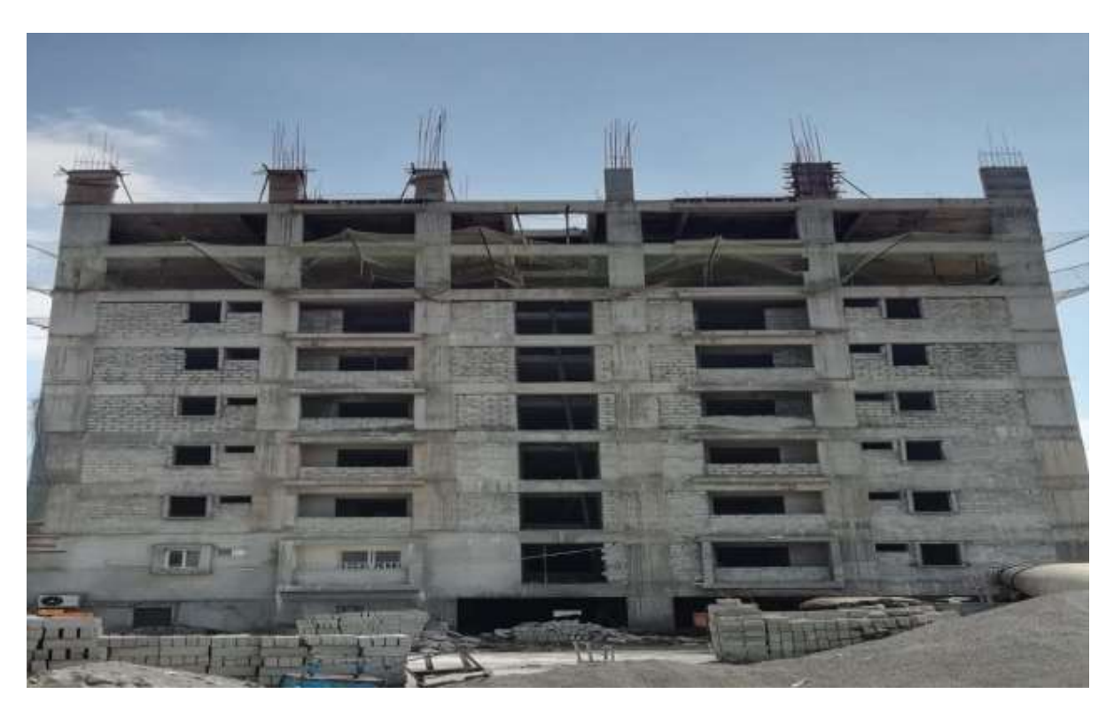
Block B2: Third Floor Level slab concrete casting 100% completed. Bar bending works for Columns up to fourth floor level on progress.

Block B1: Ninth Floor Level slab Concrete casting 100% completed. Column concrete upto Tenth floor level 35% completed and balance work on progress.