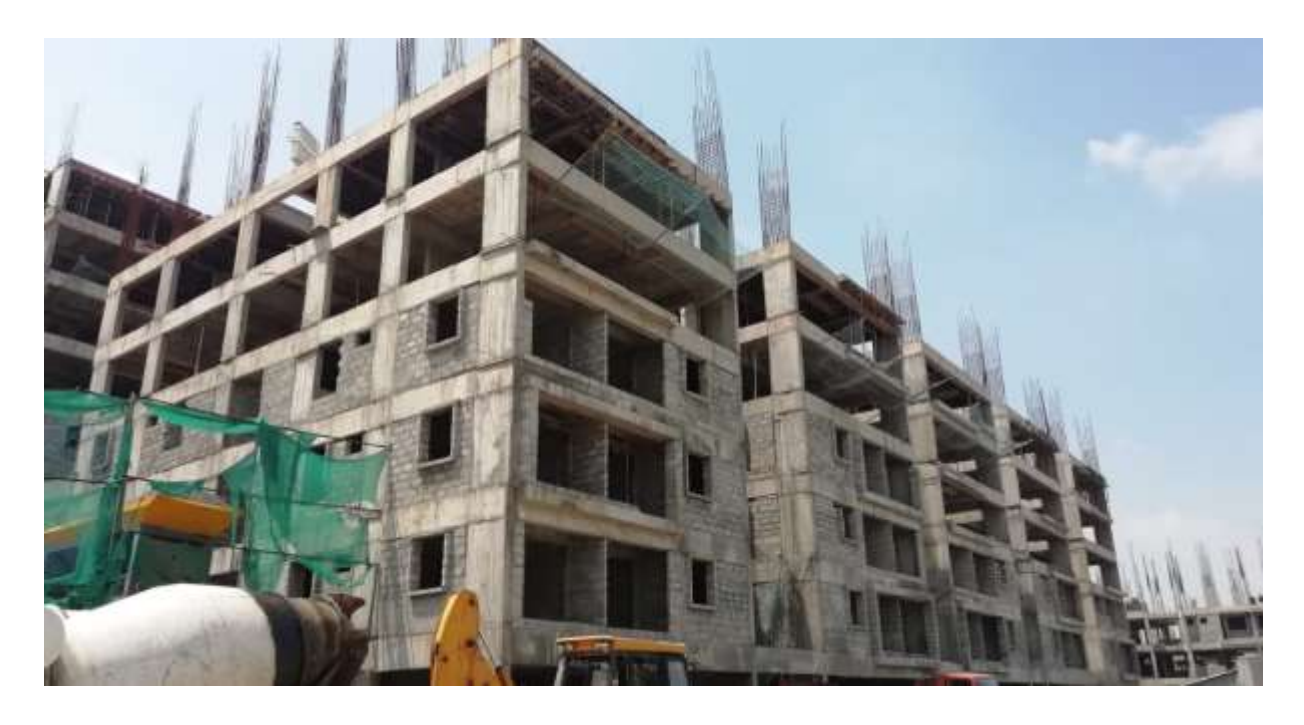
Block D1: Fourth Floor level slab First half concrete 100% completed. Shuttering & Barbending works for Second half of Fourth Floor level slab 75% completed.

Block C3: Sixth Floor level slab concrete 100% completed. Barbending works for Column upto Seventh floor level 25% completed and balance works on progress.